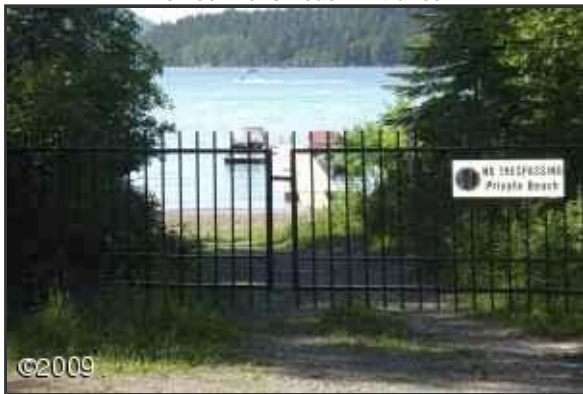
Homeowner's Beach Entrance