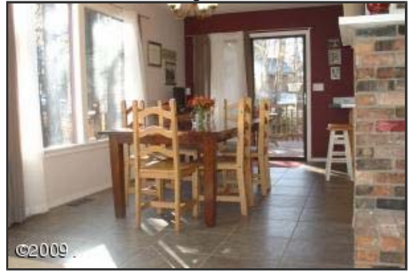
Dining Room 4