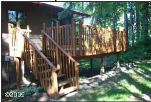
Backyard Elevation & Deck