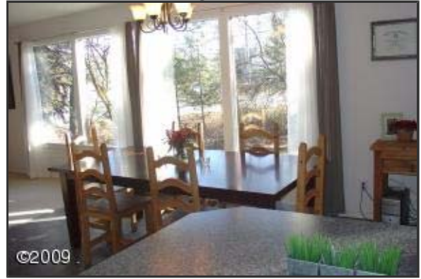
Dining Room 2