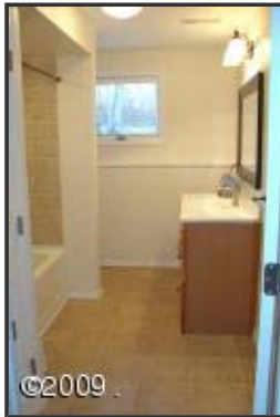
Downstairs Full Bath