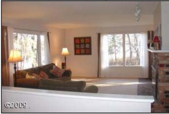
Upstairs Family/Living Room