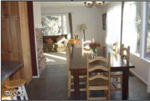
Dining Room 3